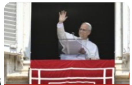
Pope at Angelus: Invest the treasure of your life in love and mercy